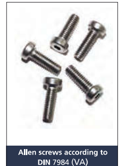
Allen screws according to DIN 7984 (VA)