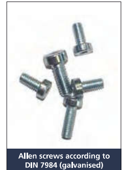
Allen screws according to DIN 7984 (galvanised)