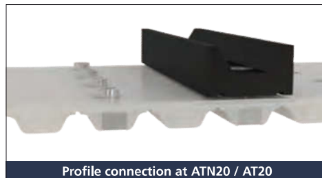
Profile connection at ATN20 / AT20